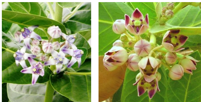
Figure 1. Flowers of Calotropis gigantea (left) and Calotropis procera (right).

From the many reviews on Calotropis species [3], C. gigantea [4–7] and C. procera [9–18], their uses in traditional medicine are so multifarious that all plant parts including the latex are remedy for many kinds of ailments and infections. A literature review on different plant parts of C. procera reported as many as 77 ethno-medicinal uses, notably, latex (27), leaves (19) and roots (10) [19]. The scientific evidence of some of these uses requires validation.