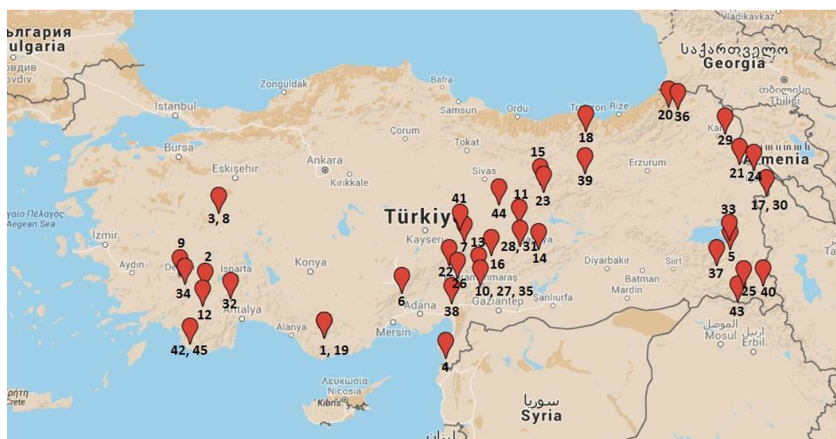
Figure 1. Geographical distribution of the studied Salvia species [12]

b Since 1985, Salvia cryptantha Montbret & Aucher ex Benth. is used synonym for Salvia absconditiflora Greuter & Burdet in the flora of Turkey [223].