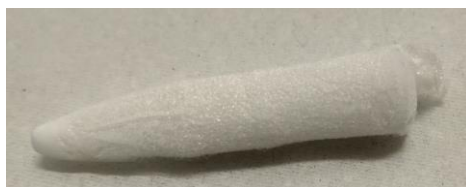
Figure 2. Iota carrageenan xerogel

Addition of water to IPA in the homogenous TH reaction of cyclohexene with PdCl 2 (Table 1, entry 3) yielded a lower conversion rate than the reaction without water (entry 1). Yet, when water was mixed with IPA solution of Pd(OAc) 2 , it resulted in a much higher conversion rate in comparison to the reaction without water (Table 1, entries 4 and 2, respectively). In addition, performing a blank TH reaction, where neat iota xerogel (Figure 2) was added to the reaction mixture in the absence of palladium catalyst, did not yield any product. However, when neat iota xerogel was added to the reaction mixture with both palladium salts, a very high activity rate was observed (entries 5 and 6).