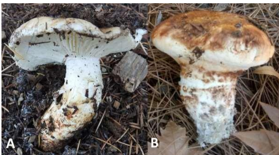
Figure S1. Basidiomata of T. anaticum (A) and T. caligatum (B)