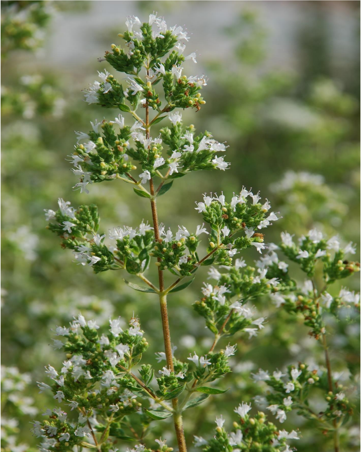
Figure S3: O. vulgare subsp. hirtum