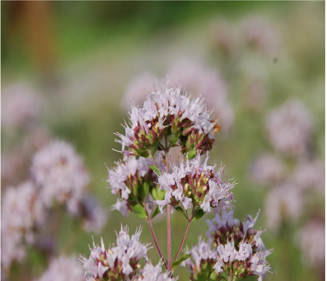
Figure S4: O. vulgare subsp. vulgare