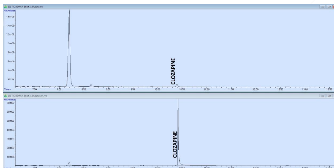
Figure 1. Chromatogram of the blank urine sample (SCAN mode on top, SIM mode on bottom)

In this study a GC-MS method has been developed for determination of zolpidem in urine for the evaluation of antemortem and postmortem intoxication cases. Urine samples were analyzed by the developed method and no interference was observed. Both total ion chromatograms and selected ion chromatograms of blank urine sample and the spiked urine sample were shown in Figure 1 and Figure 2, respectively. Peak shapes and resolutions of analytes were found good enough and there was no interference peak close to related retention times in urine for zolpidem and clozapine as well. It was observed that the sensitivity of the method was better in SIM mode of the method as it can be seen in figures. Quantitation was obtained by SIM mode of the study. Retention times ( \text{min}\pm\text{SD} ) and monitored ions ( m/z ) of zolpidem and clozapine standards were found 9.68\pm 0.004 min. (219, 235, 307), 10.42\pm 0.004 min. (243, 256, 326) respectively. Total sample preparation time was recorded as 45 min starting from extraction to analysis. Only in 60 min. a sample was treated and analyzed by GC-MS with the aid of one step extraction method. It was revealed that, this duration is very short for a quantitation method conducted by an advanced analytical technique. Thus, any rapid test does not need before quantitation such as immunoassay etc.